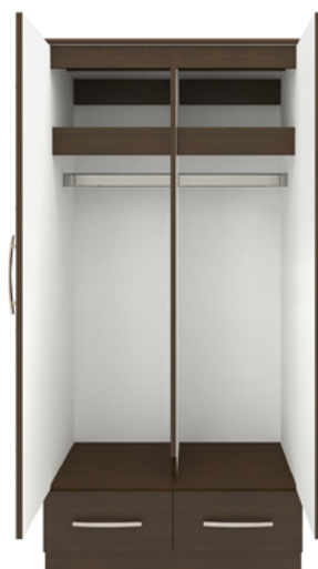
Model: HLALZ 34.5W 23.75D 71H

Kwalu's Hollywood Dementia/Alzheimers Wardrobes are thoughtfully designed to support resident independence and safety. Light colored interiors help with spatial orientation. Features include softly rounded edges and waterfall detailing. Hidden door latches and passive locks allow caregivers exclusive access. Choose from dozens of hardware styles, including ADA-compliant. The product is required to be wall mounted for safety. Using the kit provided, please follow provided instructions exactly.